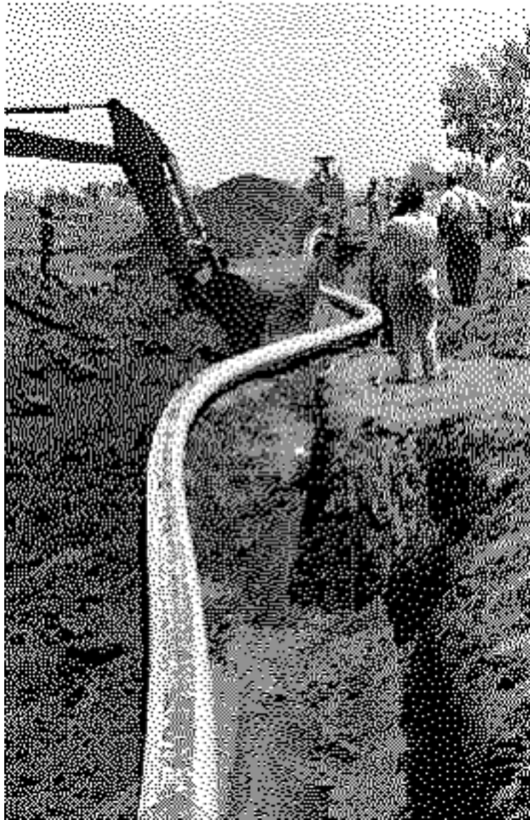
Figure 3 Damage to the natural gas pipeline near Tennant Creek NT, January 1988

such as roads and power lines. In less than 30 years, 7 Australian earthquakes have ruptured the ground surface, seven of only 10 worldwide in intraplate regions. Classic pipeline failures near Meckering WA in 1968 and Tennant Creek NT in 1988 are well documented. The first was a brittle failure in a cast iron water pipe, the second a ductile failure in a mild-steel gas pipeline (Figures 3).