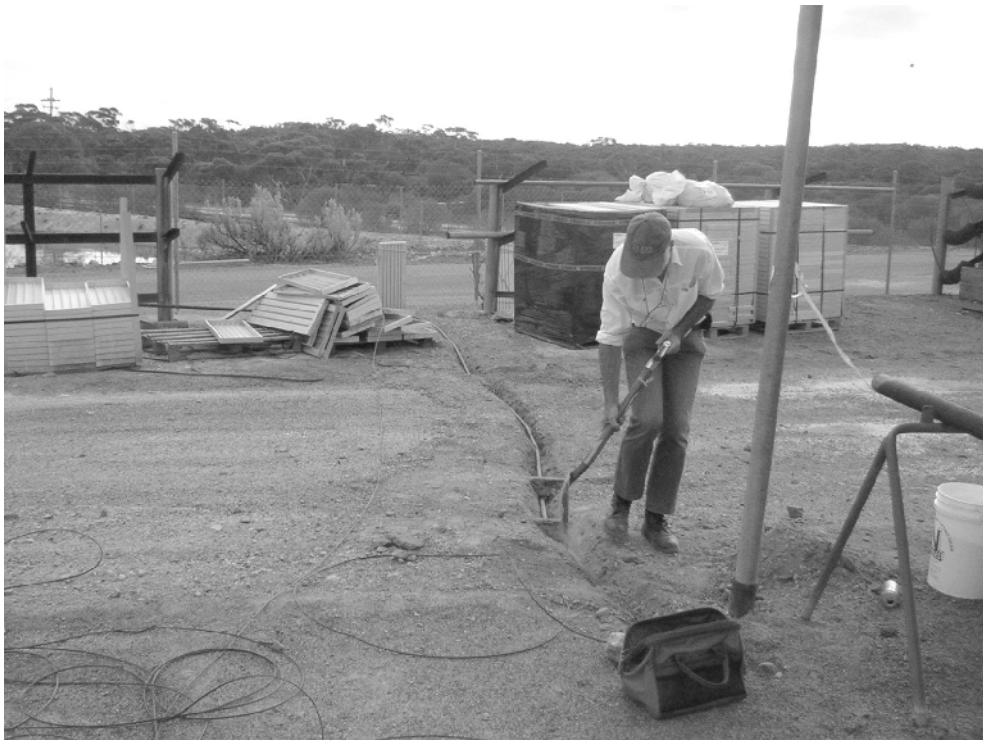
Figure 3 Installing the first ACG recorder at Longshaft Mine