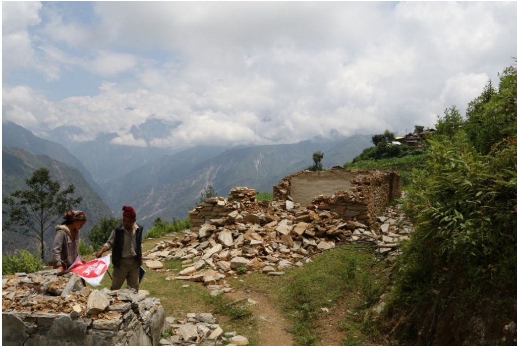
Figure 6. School building in Yamagaum.

Above the village tension cracks were observed in the terraced hillslope. The width of the cracks varied between approximately 10mm and 40mm and they ran parallel to the slope for approximately 50m. It should be noted that accurate observations of crack widths were hampered as locals had attempted to fill in the cracks. This operation was both observed and reported by locals who stated that the purpose was to prevent ingress of water. Other cracking was observed lower down the slope. Due to time constraints the exact extent and nature of the observed cracks were not established.