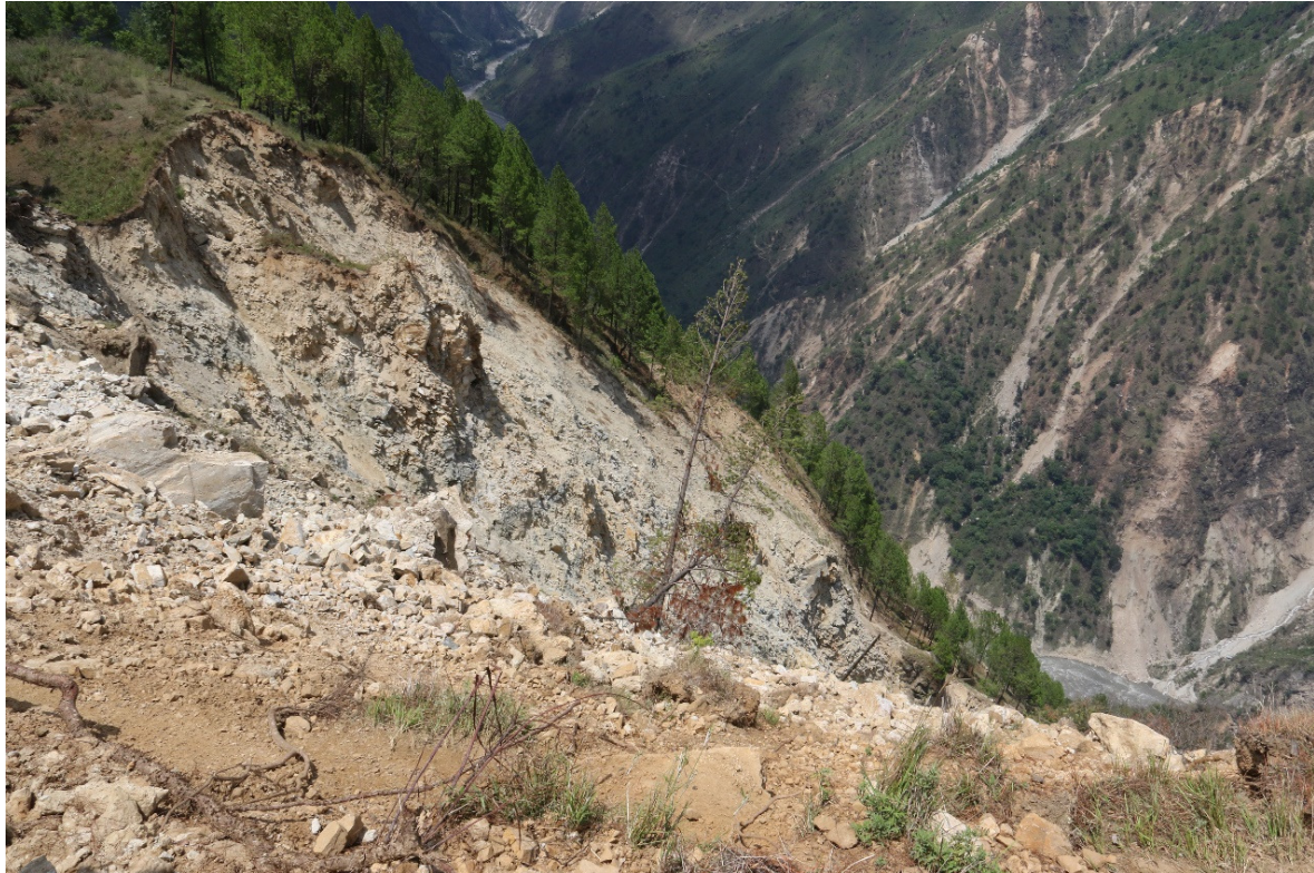
Figure 9. Landslide in Lapsibot.