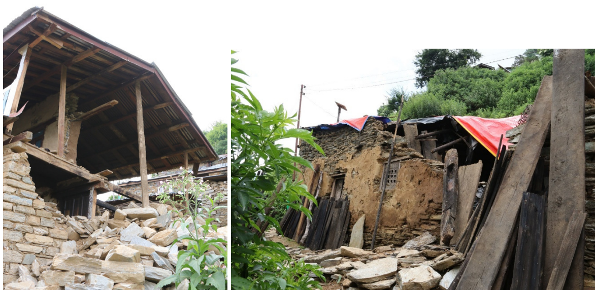
Figure 5. Examples of building and typical damage in Yamagaum.

A rapid tour (approx. 30 mins) of the village and immediately surrounding slopes was made. This village is located on a steep sided hillslope in Gumda district. The village consists of 47 households, mainly rubble masonry construction with timber and corrugated steel sheet roofs. The construction quality of these dwellings is very poor. The mortar was very weak although it did have some form of binding material (most likely either cement or lime). Most of the buildings suffered either partial or complete collapse (examples are shown in Figure 5).