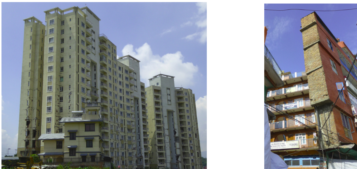
Figure 2. Reinforced concrete framed buildings with masonry infill.

To help relate the damage resulting from this earthquake to other seismic events, it is necessary to understand the building typologies of the given region so that the damage can be described relative to other buildings of this type. The better constructed buildings located in Kathmandu were mainly reinforced concrete framed structures with masonry infill. The buildings were typically up to approximately 4 storeys high, but there were examples of structures up to 7 stories, with the tallest building encountered being 14 stories. These buildings were often very slender and it was surprising that many of these structures survived an earthquake of this magnitude. Pictures of surviving slender concrete buildings as well as a 14 storey structure are shown in Figure 2.