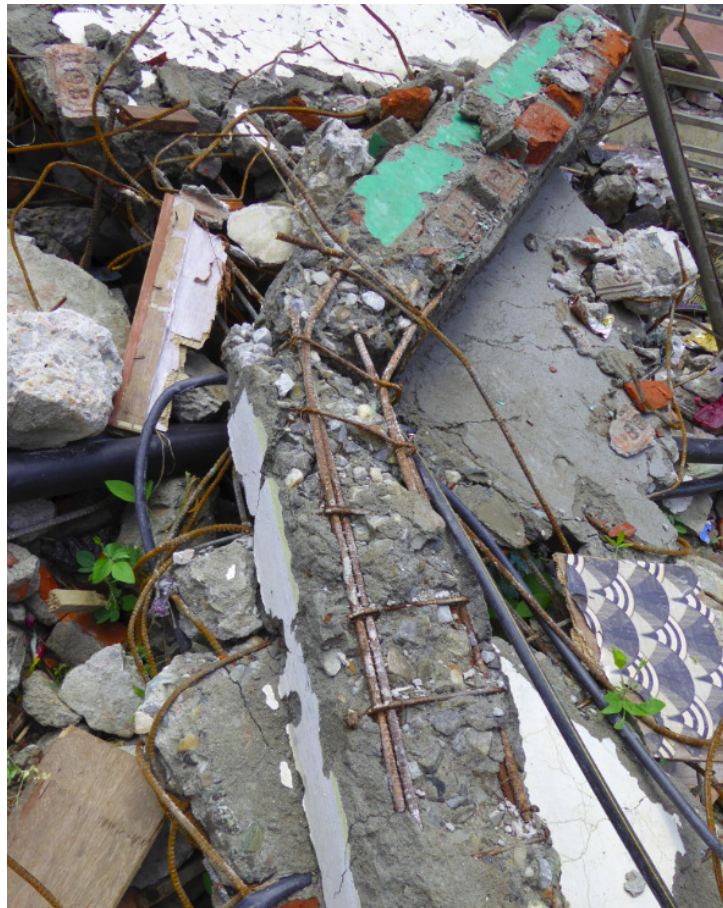
Figure 4. Detail of column reinforcement.

that were under construction) and reasonably closely spaced confinement reinforcement. It should be noted however that the concrete had very large aggregate in it and was not of good quality and the column dimensions were quite small (approx. 225mm square). The reason for the collapse of this structure is not clear, and could be either related to poor structural layout (causing a soft-storey collapse) or not all of the connections being well detailed. There was evidence of this latter point, but it is difficult to say for certain if either of these mechanisms were responsible.