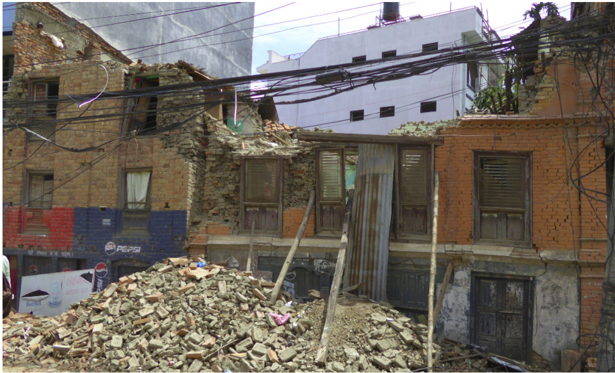
Figure 3. Example of partial collapse of a masonry structure near Kathmandu.

There was also many two-storey masonry buildings as well as rubble masonry buildings. The masonry buildings consisted of low-fired clay bricks typical of regions such as this and were therefore weaker than well-fired bricks typically used in more developed regions. The rubble masonry was typically of poor construction and was common in poorer regions of Kathmandu as well as in outlying areas. Mortar in these buildings was often either very weak or sometimes without any form of binder. These buildings typically showed either complete or partial collapse and aftershocks were causing further collapse to already weakened structures or damage due to secondary collapses. Typical masonry structures are shown in Figure 3.