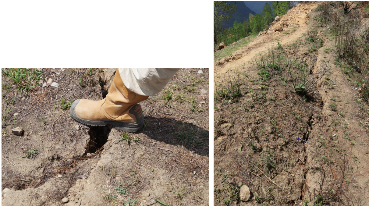
Figure 8. Tension Crack.