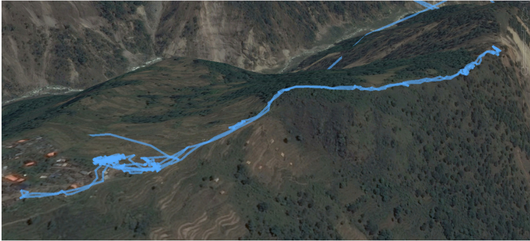
Figure 7. Route of landslide survey.