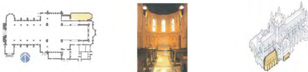
Figure 10: The Warriors' Chapel constructed 1924

World War 1 curtailed the construction programme on the Cathedral. However, as early as 1915 steps were taken to erect a war memorial "if we win the war" (Murray, 1991). The Warriors Chapel was completed in 1924, adding a significant aesthetic and social component to the Cathedral. The Chapel was constructed in a separate structural