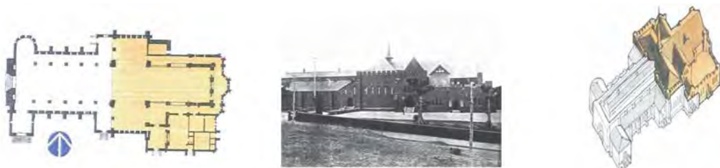
Figure 8: Temporary roof to the chancel installed 1909

process, brick pilasters to the main nave columns were removed and sandstone facings to the crossing arch supports were introduced. At this time, the deteriorated brickwork was repointed with a hard cement-based mortar to all internal faces. This work was completed and the Cathedral opened for service in 1902. Within five years the Cathedral suffered severe structural damage to its western end with severe mine subsidence which occurred again two years later.