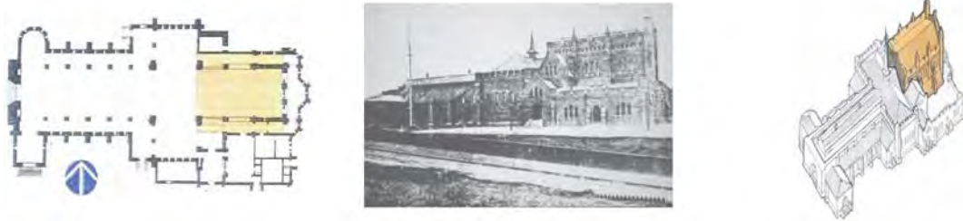
Figure 9: The chancel raised to its full height, 1912

The next construction phase began in 1909 with the temporary roofing of the chancel and the construction of the vestries to a new design by Newcastle Architect, F.G. Castleden. With this construction the brick type changed and the joint sizing increased