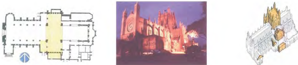
Figure 12: The tower and transepts completed 1979

The final construction phase was the raising of the transepts and the completion of the massive bell tower using cavity work, cement mortar and a relatively soft clay face brick compared to the lower portion of the building. This work was designed by Architect John Sara, of the Newcastle firm of Castleden & Sara, and completed in 1979.