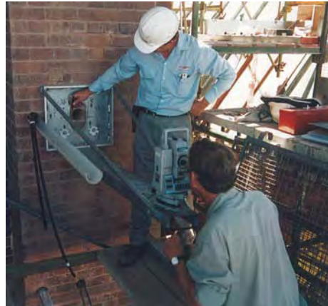
Figure 18: Drill hole survey

The significant role implemented by the quantity surveyors was the cost management of the project budget during the construction phase using trade schedules for the major trades of brickwork, reinforcement and brickwork restoration, preparing estimates for various trade packages and monitoring of the cost plus categories of the work.