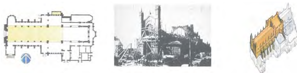
Figure 11: The nave and tower base raised 1926

1926 saw the Nave raised to its full height with flying buttresses and the introduction of a cavity within the brick wall. The base of the Tower was completed and the Western