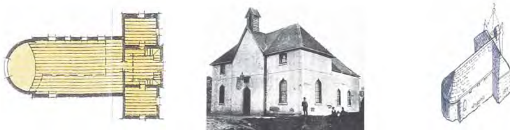
Figure 4: The remaining tower removed and bellcote added, circa 1868

From its inception in 1817, the small brick and stone church was gradually demolished with the tower being reduced in two separate stages due to instability. Firstly, in 1825