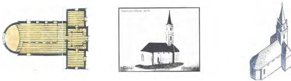
Figure 2: The original Christ Church, 1817

The chronological history of construction on the Cathedral site began in 1817 with the erection by convict labour of a small 'T' shaped Church built of brick and stone with a steeple 30.48m (100 feet) tall. From plans, artists' impressions and photographs, the exact location of any probable archaeological deposit was able to be determined. The protection and management of the remnant footing from 1817 was given equal precedence with the rest of the building. During removal of destabilised floors in the nave area, portions of the original stone footings were uncovered, recorded and retained without disturbance. The knowledge of the existence and location of the archaeological deposits greatly influenced the design and construction methods of the new reinforced