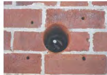
Figure 17: Finished installation prior to brickwork repair

from where the drill rods could be redirected if necessary. Dry drilling by non-coring, polycrystalline diamond bits, using air for cooling and cuttings removal was successfully used, after trials of different bit types and drilling sequences.