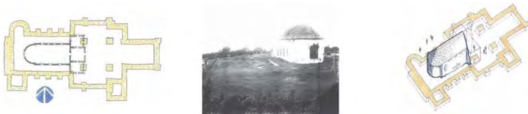
Figure 5: The footings of the new Christ Church cathedral laid in 1883

the steeple, upper tower and 3 m (10 feet) of the lower tower were removed and some time after 1868 the remaining portion of the tower was removed and a small bellcote installed. In 1883 the installation of the mass concrete footings for the new Cathedral