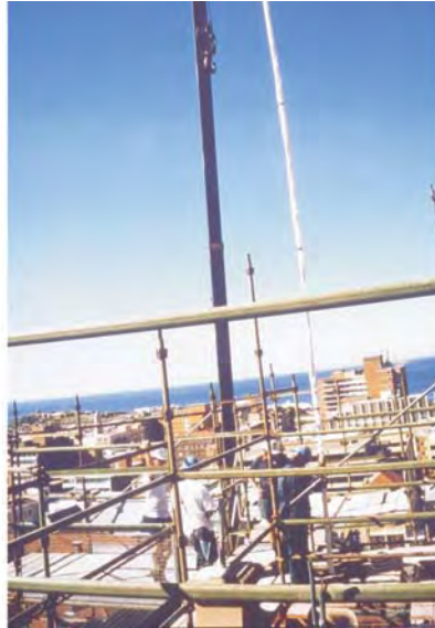
Figure 16: Vertical anchor installation by crane