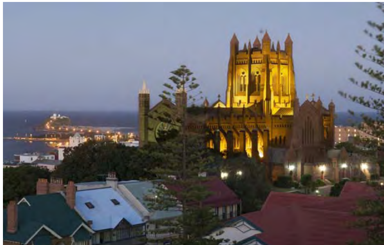
Figure 1: Christ Church Cathedral, Newcastle NSW

As well as the familiar "p-" and "s-" waves associated with vibrations in solids, earthquake waves (or any vibrational wave in a solid with a boundary plane) can be shown to