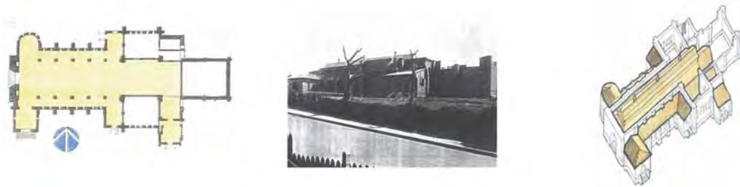
Figure 7: The temporary roof to the nave installed in 1901

In 1901 a new Architect was appointed to temporarily roof the nave, the crossing, the baptistry and the porch at half the final height and prepare it for occupation. In the