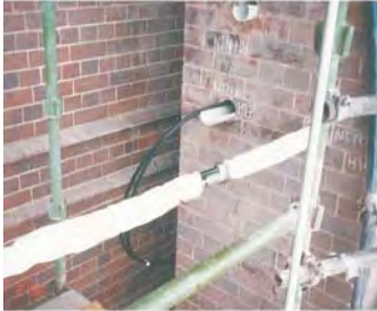
Figure 15: Horizontal anchors assembled during installation

long holes, where inspection panels were able to be opened along the line of the holes