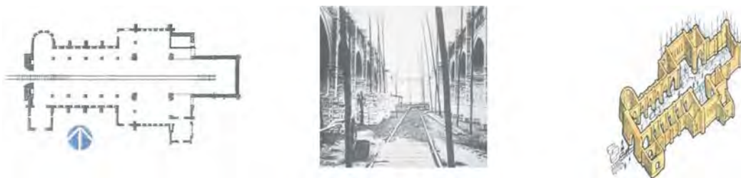
Figure 6: The lower external walls as they stood for a period of eight years from 1893

led to the demolition of the 1817 Church in two stages, firstly the East End and then the West End. This demolition even caused consternation between the Design Architect John Horbury Hunt and the Dean of the Cathedral. This argument centred around the structural integrity of the footing and the desire of the Dean to retain the building in use for as long as possible. Horbury Hunt demanded that the tower footings must be laid at the same time as the wall footings so as to negate the possibility of differential