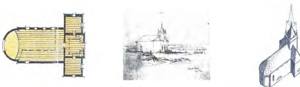
Figure 3: The spire and portion of the tower removed in 1825

The chronological history of construction on the Cathedral site began in 1817 with the erection by convict labour of a small 'T' shaped Church built of brick and stone with a steeple 30.48m (100 feet) tall. From plans, artists' impressions and photographs, the exact location of any probable archaeological deposit was able to be determined. The protection and management of the remnant footing from 1817 was given equal precedence with the rest of the building. During removal of destabilised floors in the nave area, portions of the original stone footings were uncovered, recorded and retained without disturbance. The knowledge of the existence and location of the archaeological deposits greatly influenced the design and construction methods of the new reinforced