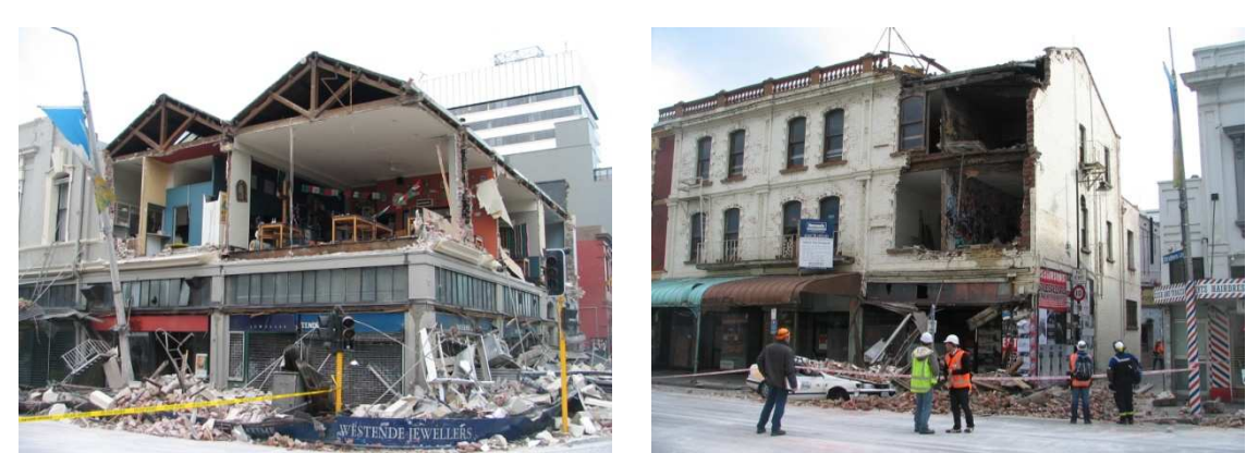
(a) Corner Worcester and Manchester St. (b) 118 Manchester Street Figure 9. Examples of out-of-plane failures in solid masonry walls.

In some cases wall-diaphragm anchors remained visible in the diaphragm after the wall had failed, again indicating that failure had occurred due to bed joint shear in the masonry (refer Figure 11). Figure 11(b) shows a situation where a diaphragm anchor had been embedded within the wall. It can be seen that the anchor successfully prevented the restrained wall from failing, but was not able to prevent toppling of the masonry above the anchor.