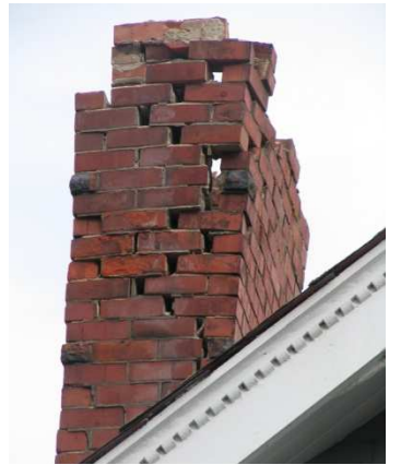
(b) Unstable damaged chimney