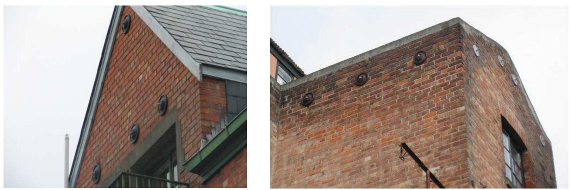
Figure 15. Successful gable end wall and side wall anchorages.

A significant feature of the earthquake was the number of occasions where wall-todiaphram (floor or roof) anchors performed well. Photographs showing this are presented in Figures 15-16. A typical wall-to-diaphragm anchor typically consists of a long 20 mm bolt with a large circular disk of about 150-200 mm diameter between the wall exterior and nut that clamped the disk to the wall.