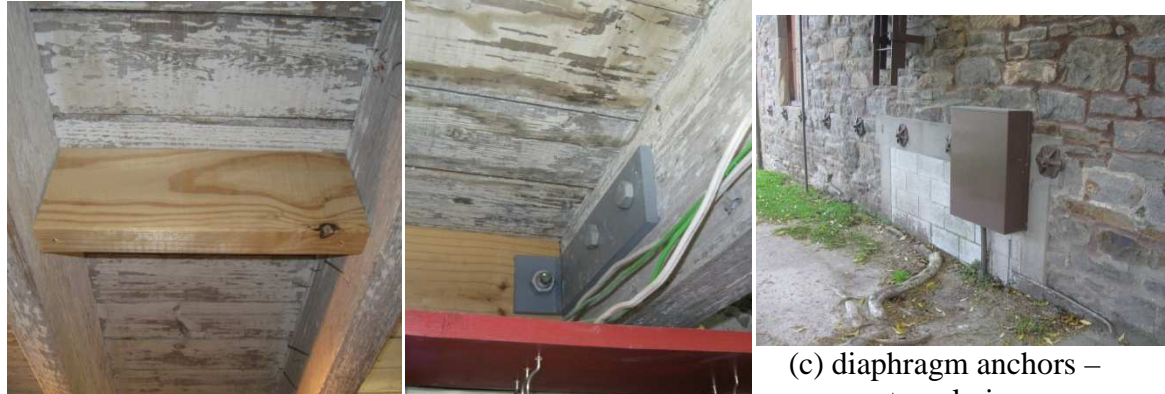
(a) blocking of joists (b) joist-wall connection external view Figure 20 – strengthening of floor diaphragm and wall anchors

The roof diaphragm was stiffened through the addition of an internal steel frame (Figure 19). The frame was attached to the original timber roof trusses, and connected to the external walls. The floors were stiffened through the addition of blocking between joists (Figure 20a), and steel plates were added to connect some of the joists to the masonry walls (Figure 20b). Externally, diaphragm ties were visible on all sides at floor levels indicating that the floors had been anchored to the walls (Figure 20c).