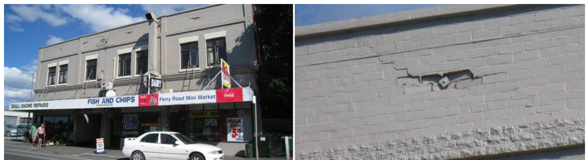
(a) Building overview(b) Detail of partial anchorage failureFigure 17. Onset of wall-roof anchorage failure.

Another interesting feature of this earthquake is the observation of walls that only partly failed, allowing for identification of the specific failure mode at its onset. An excellent example is a 2-storey URM building on Ferry Road (see Figure 17) where the front, street facing, wall of the building had started to fail out-of-plane despite the presence of wall-roof diaphragm anchors. As shown, the anchors were on the verge of pulling through the masonry wall. Internal inspection of the building revealed that the front wall had separated from the long side walls of the building and moved approximately 50 mm towards the road with respect to the ceiling/roof diaphragm.