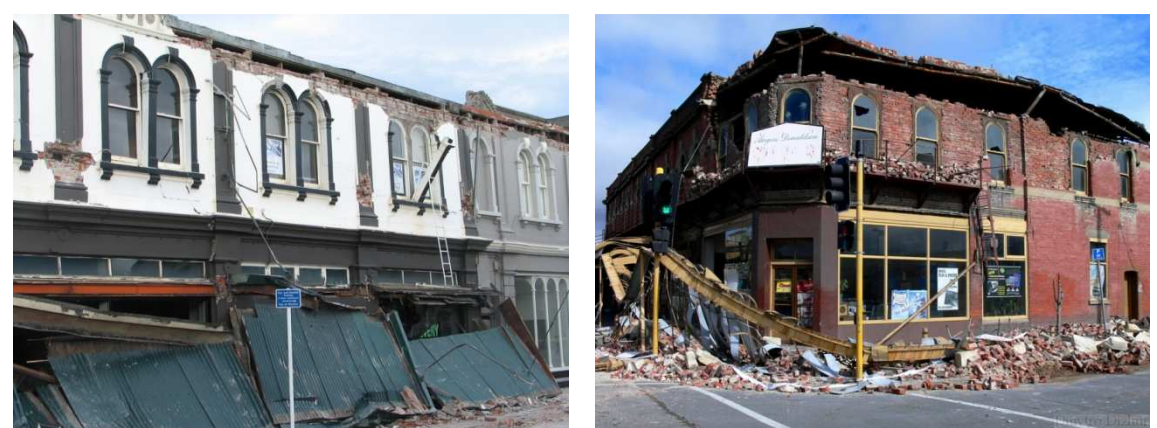
(a) Multiple front wall parapet failures(b) Corner of Sandyford and Colombo St.Figure 8. Examples of typical parapet failures.

Numerous parapet failures were observed along building frontages and along their side walls, and for several URM buildings located on corners, the parapets collapsed on both perpendicular walls (refer Figure 8). Restraint of URM parapets against lateral loads has routinely been implemented in New Zealand since the 1940s, so whilst it is difficult to see these restraints unless roof access is available, it is believed that the majority of parapets that exhibited no damage in the earthquake were provided with suitable lateral restraint. In several cases, it appears that parapets were braced back to the perpendicular parapet, which proved unsuccessful.