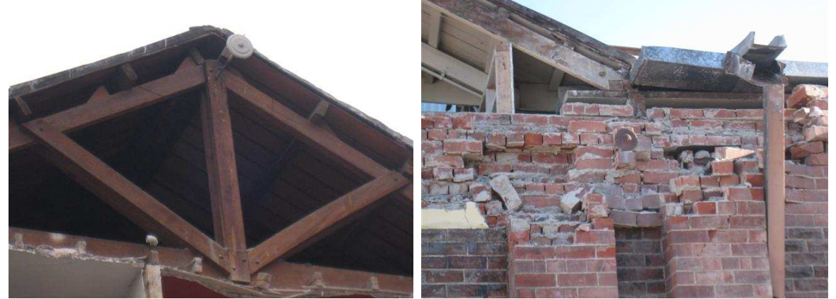
(a) Gable wall failure despite anchor(b) Wall anchor still intactFigure 11. Wall-to-diaphragm anchor details.