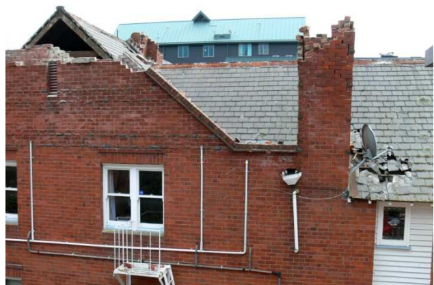
(a) Two damaged chimneys and gable wall.