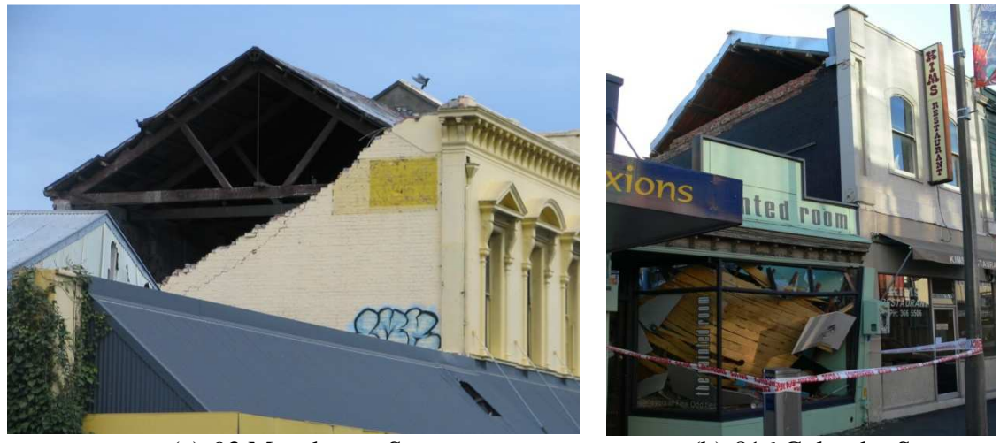
(a) 93 Manchester St (b) 816 Colombo St Figure 7. Examples of gable end wall failures.

Many gable end failures were observed, often collapsing onto or through the roof of an adjacent building as seen in Figure 7. However, there were also many gable ends that survived; many more than might have been expected, with the majority having some form of visible restraints that tied back to the roof structure. These examples are shown and discussed later (refer Figures 15-17).