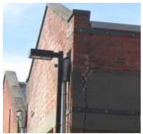
Figure 21 – Examples of corner ties