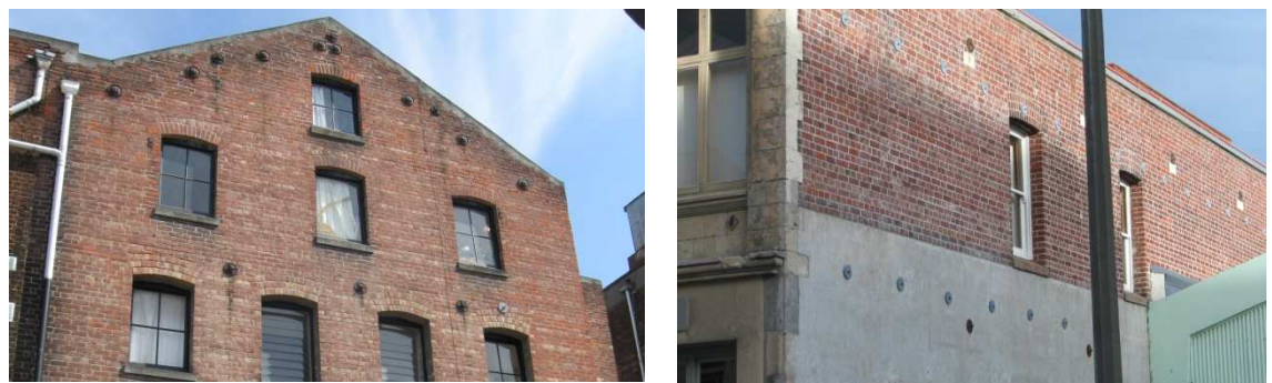
Figure 16. Successful wall-floor and wall-roof diaphragm anchorages.

Another interesting feature of this earthquake is the observation of walls that only partly failed, allowing for identification of the specific failure mode at its onset. An excellent example is a 2-storey URM building on Ferry Road (see Figure 17) where the front, street facing, wall of the building had started to fail out-of-plane despite the presence of wall-roof diaphragm anchors. As shown, the anchors were on the verge of pulling through the masonry wall. Internal inspection of the building revealed that the front wall had separated from the long side walls of the building and moved approximately 50 mm towards the road with respect to the ceiling/roof diaphragm.