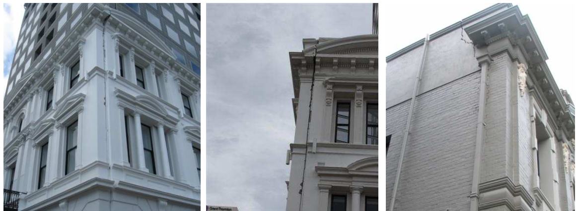
Figure 12. Examples of wall separation at corners of buildings.

Several walls exhibited some damage to in-plane deformation where the cracks were mostly seen to pass vertically through the lintels over door or window openings. There were also several examples of URM buildings with different storey heights 'pounding' against each other. However, these mechanisms were not widely observed.