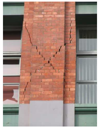
(a) Overview of building(b) North wall pier, level 3.Figure 13. Manchester Courts building.