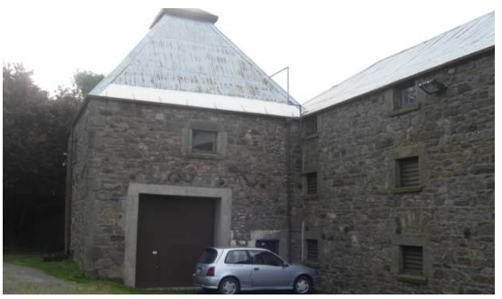
Figure 18 – Malthouse Theatre

Diaphragm stiffness has a significant effect on the behaviour of a building during earthquakes, as observed at the Malthouse Theatre (Figure 18). Prior to the earthquake, the stone masonry building from 1867 underwent an extensive seismic retrofit involving stiffening of floor and roof diaphragms and connecting it to the external walls.