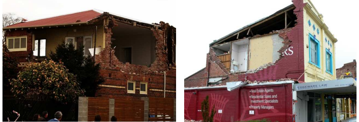
Figure 10. Examples of out-of-plane failures in cavity walls.

In some cases wall-diaphragm anchors remained visible in the diaphragm after the wall had failed, again indicating that failure had occurred due to bed joint shear in the masonry (refer Figure 11). Figure 11(b) shows a situation where a diaphragm anchor had been embedded within the wall. It can be seen that the anchor successfully prevented the restrained wall from failing, but was not able to prevent toppling of the masonry above the anchor.