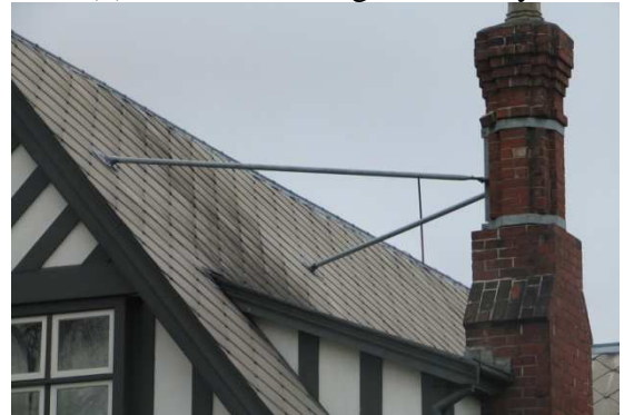
(c) Emergency services remove chimney.(d) Braced chimney performed wellFigure 6. Examples of chimney performance during the Darfield earthquake.