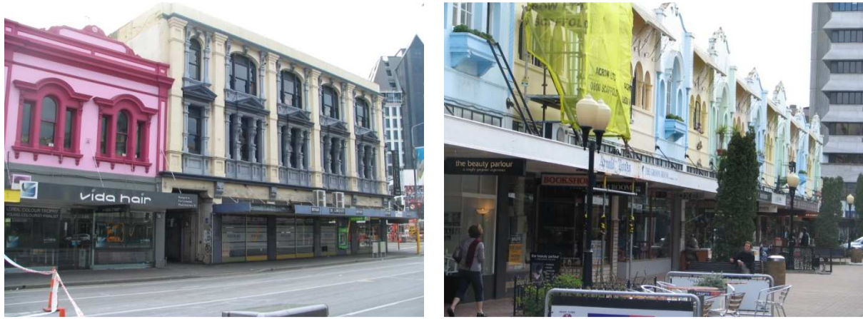
Figure 4. Typical 2- and 3-storey URM buildings in Christchurch.

complete discussion of the behaviour of URM buildings during the 2010 Darfield earthquake, refer to Ingham and Griffith (2010).