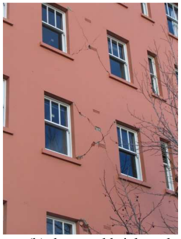
(a) Overview of building (b) damaged brickwork Figure 14. Views of St Elmo Chambers building in Montreal Street.