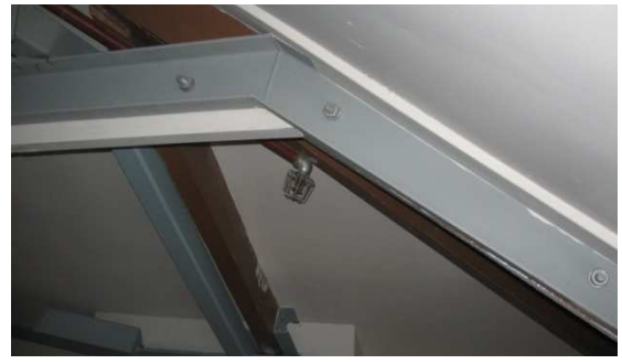
Figure 19 – Steel frame in roof