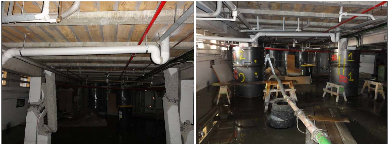
Figure 7 Retrofit repairs of partially collapsed columns