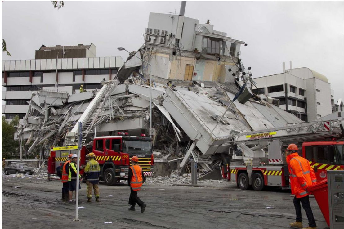
Figure 2 Pyne Gould Building Collapse