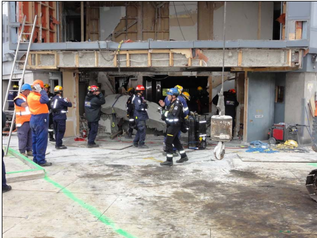
Figure 4 Forsythe Barr Building Staircase collapse