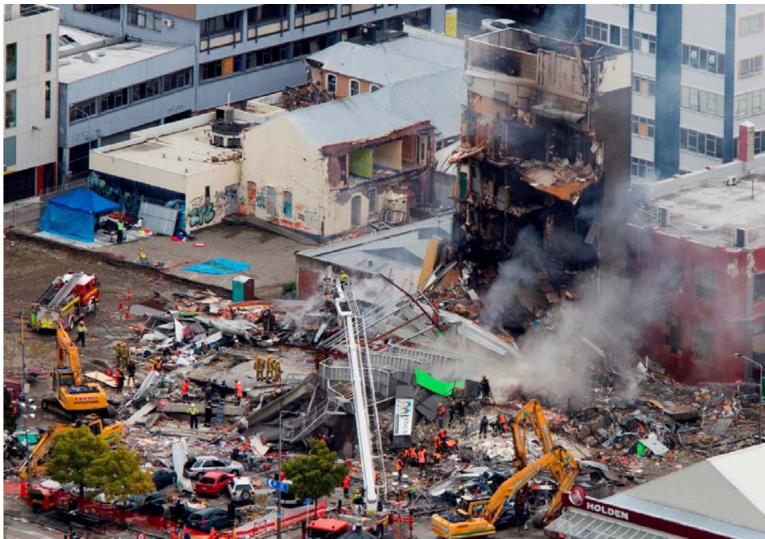
Figure 3 Canterbury Television Building collapse