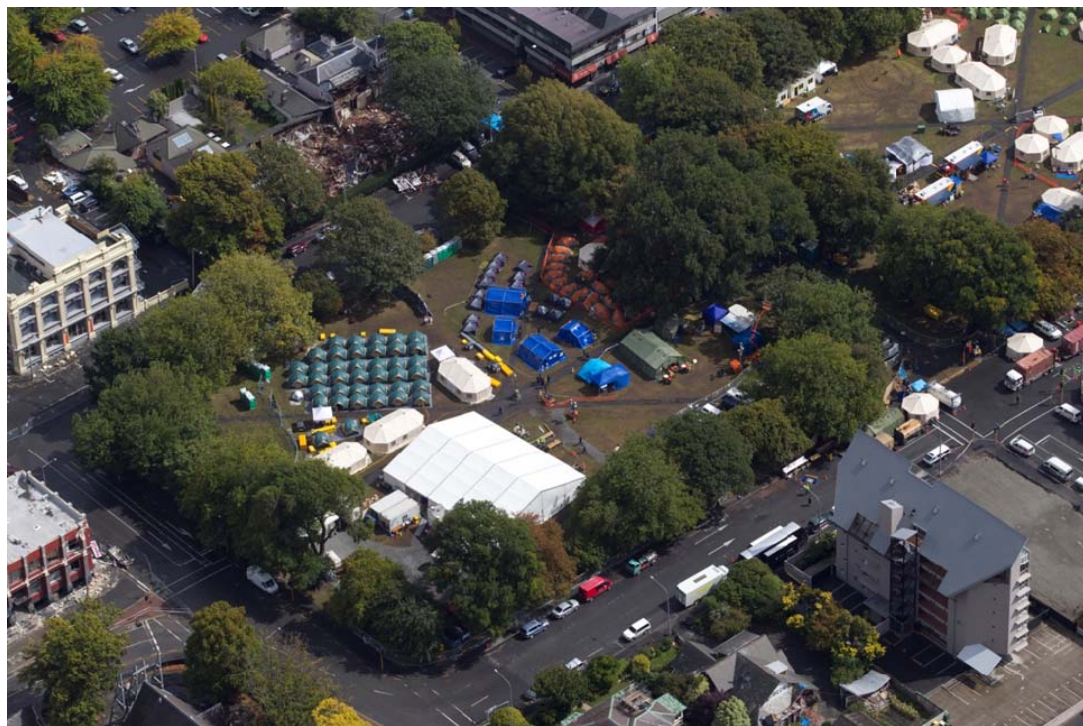
Figure 5 USAR camp Latimer Square