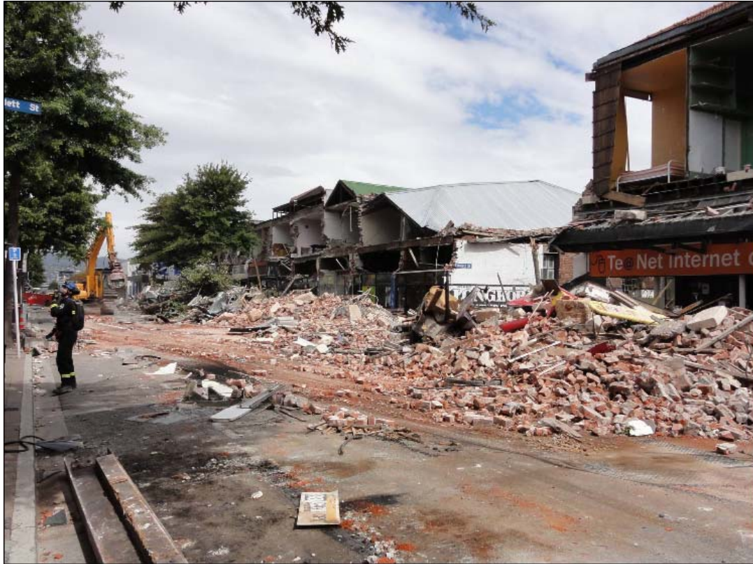
Figure 6 URM damage and debris in streets