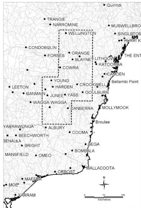
Figure 1: Area of interest

This paper outlines the process leading to the modifications to the AUS5 model for the central New South Wales region (Figure 1), using geological data and historical earthquake records in order to identify active faults as earthquake sources, and to improve the surrounding area sources accordingly.