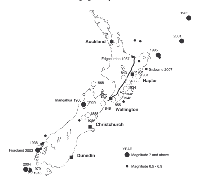
<u>Figure 1</u>: Occurrence of moderate-large shallow earthquakes in New Zealand since 1840. Filled circles are for recent earthquakes, 1955 to 2007 inclusive, and open circles for pre-1955 events. The Wellington Fault and associated structures are shown as a heavy black line.

Zealand's largest city, in one of the least active. Activity in the Christchurch and Dunedin areas is intermediate between that of Wellington and Auckland. These differences are illustrated by Figure 1, which shows the locations of the major shallow earthquakes that have occurred in the New Zealand area since 1840. Note that while there have been no major earthquakes close to large urban centres in recent times, prior to 1955 there were near-direct hits on Wellington and Napier. There were no significant injuries in the most recent damaging earthquake, Gisborne 2007.